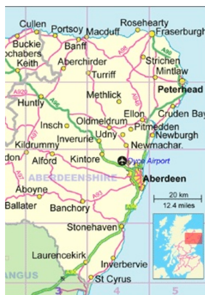
The eastern half of Aberdeenshire, north-eastern Scotland (Crimonmogate lies between Peterhead and Fraserburgh)