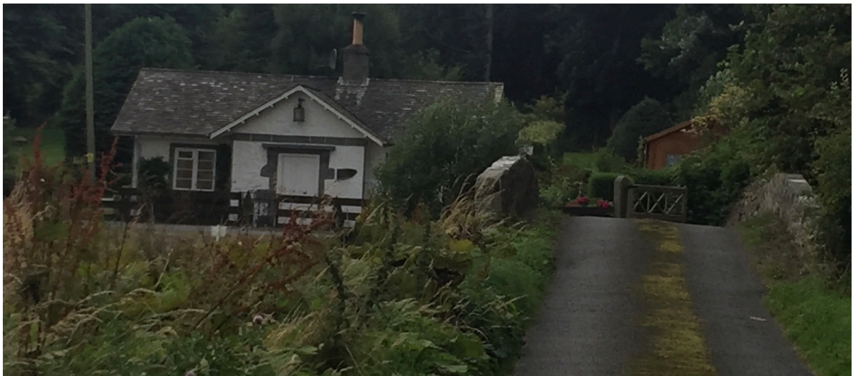
The Dochertys' former cottage at East Lodge