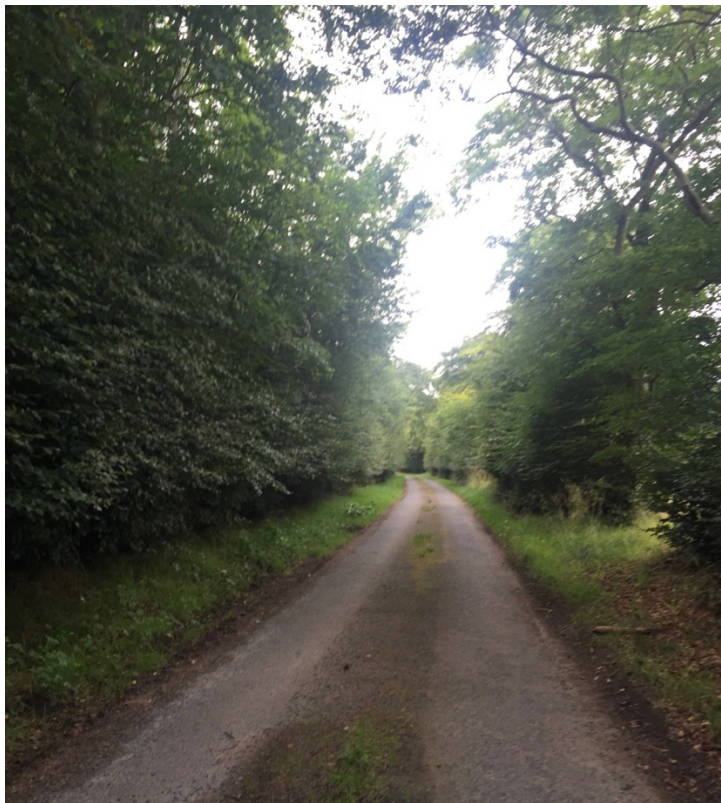
The track running past East Lodge to the back entrance of the estate which the convoy instead used