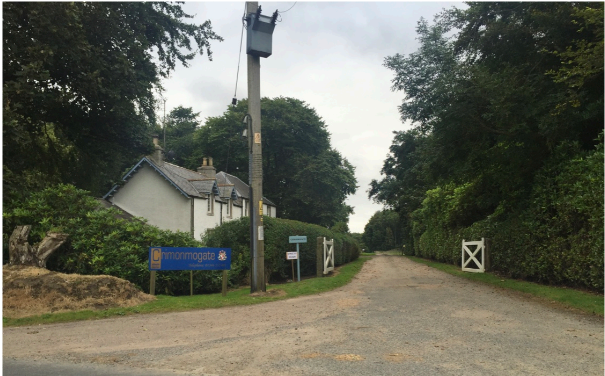
The main entrance to the front of Crimonmogate Estate from the B9033 which one would have expected the convoy of expensive cars (see pp. 36-37) to have used at dusk on a September evening