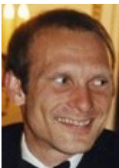
Viscount Petersham (William Stanhope)