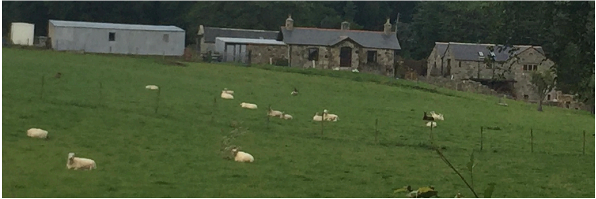
The gatehouse properties at East Lodge, Crimonmogate (in the neighbourhood of Lonmay) (Alan Low's very large home is to the right)